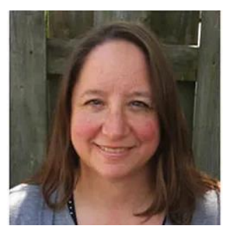
Coaching Level: 3 Gold in Freeskate & Dance Years of Coaching: 31